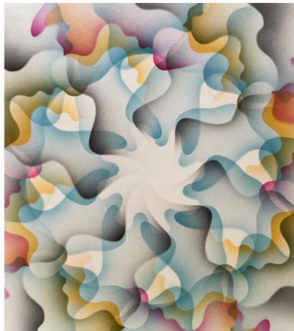
Forty Little Mothers . Acrylic on paper 43 x 36cm, 2021.

However, using a spray gun technique, Ruscha breaks the occidental search for the perfect, which the artist defines as boring and finite. Highlighting imperfection as an essential element within his works, the viewer becomes aware of their almost invisible irregularity. The flow of time and the things in it, return to Ruscha's latest production of works on paper created in occasion of the exhibition. Natural fractals of concentric or symmetrical compositions occupy the other two walls of the gallery, generating visual rhythms potentially capable of repeating themselves in their form at different scales.