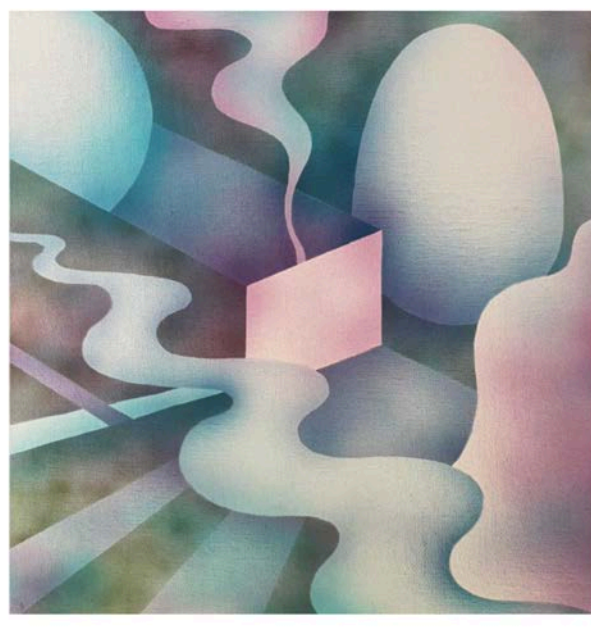
Large Egg #3 . Acrylic on canvas board 30.5 x 30.5cm, 2016.

Entering the gallery space curated by Cedric Bardawil, a series of works on canvas, each 30.5 x 30.5 cm occupies the left wall. The paintings, made between 2016 and 2019, are telescopes that reveal absurd, hallucinated worlds of impossible architectures in which the unconscious emerges through a free association of images. Surrealist elements join the Escherian influences in the presence of emblematic components. As in Large Egg #3 , he involves and associates enigmatic elements that recur in art history like the eggs and the sphere, symbols of perfection and absolute regularity.