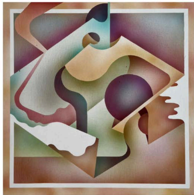
Alihi . Acrylic on canvas board 30.5 x 30.5cm, 2016.

Sinusoidal oscillation and harmonic dances break up the perception of the sensitive world and reveal cosmic universes in which sound movement takes shape, creating games of rhythm and color. Between the organic and the mechanical, perfection and error, Eddie Ruscha's art expands and contracts intangible elements of human perception such as the sound, the rhythm and the flow of time. His practice ranges from works on canvas and paper to video installations and sound performances, encapsulating Op Art and the Light and Space Movement influences of the Californian coast, where he was born and is currently based.